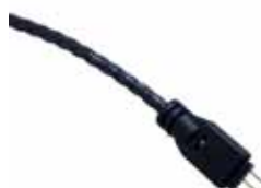
Power Input RLS-PWR