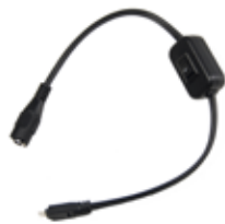
Power Input with switch RLS-PWR-SWITCH