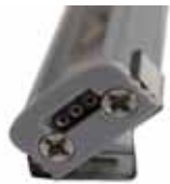
Mounting Clip - 45° RLS-CLP-45