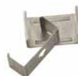
Mounting Clip RLS-CLP