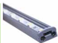
Rigid LED Strip 24V RLS-24V