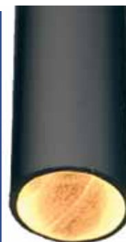
BLFO-EL500 Nominal \text{Ø}1/2'' [13mm] Actual 0.611'' [15.52mm]