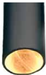
BLFO-EL375 Nominal \varnothing 3/8'' [10mm] Actual 0.451" [11.45mm]