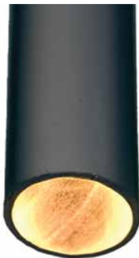
BLFO-EL750 Nominal \text{Ø}3/4'' [19mm] Spool Size : 100ft max. Actual 0.856'' [21.74mm] Custom Order Only